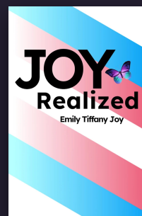
Joy Realized A MEMOIR OF BECOMING